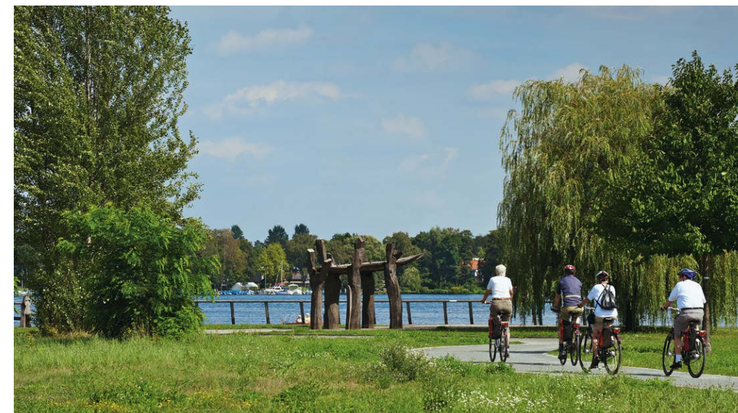
[The promenade along the Havel in Hennigsdorf, as part of the Berlin-Copenhagen long-distance cycling route, offers space for a variety of leisure activities]

» The district of Oberhavel unites two aspects which make it really worth living here. Firstly, our district has a well-developed infrastructure with sufficient preschool places and the best possible choice of schools and excellent medical care by first-rate hospitals. Secondly, a variety of leisure and recreational activities on land and in water can be found right on your doorstep. «