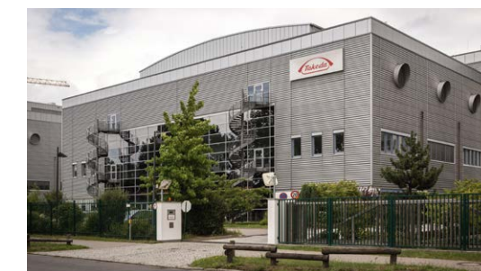
[Manufacturing facilities at Takeda Pharma GmbH in Oranienburg]

Moreover, the local foundation co:bios is engaged in a successful development of the biotechnology location. Since its foundation in 2000 it has contributed considerably to the further development of the framework conditions at the location through the clustering of industry-specific economic infrastructures and expertise.