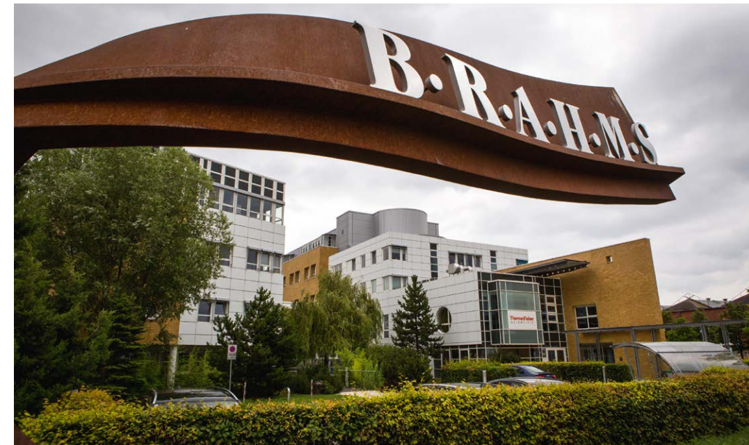
[Building complex of B-R-A-H-M-S GmbH (Part of Thermo Fisher Scientific) in the Innovationsforum Hennigsdorf]