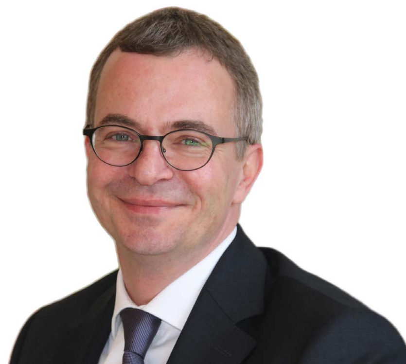
Albrecht Gerber Minister for Economic Affairs and Energy of the State of Brandenburg

The Oberhavel district ranks among the most economically strong regions in the east of Germany. It is shaped by a powerful industry and an efficient mid-sized sector. With its numerous businesses in future-industries such as biotechnology or medical technology the district is one of the most important life sciences locations in the capital region of Berlin-Brandenburg. The state of Brandenburg has supported this development considerably with its funding policy – which focuses on growth sectors and regional growth centres. The regional growth centres are driving forces which have clearly improved the economy in Brandenburg in recent years and will continue to do so. The regional growth centre O-H-V with its three towns Oranienburg, Hennigsdorf and Velten has been a model for others right from the beginning. It is a good example of innovation and the development of new and internationally competitive products.