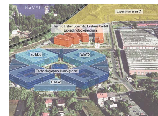
[Complex of the Innovationsforum Hennigsdorf and bird's eye view of the adjacent expansion area]

In the Innovationsforum Hennigsdorf, in addition to a multitude of customised rental units in existing buildings with expansion areas on the river Havel ready for development, there is the possibility for the growing location to realise new buildings. A current expansion in the planning phase will offer, besides the standards of CO 2 -free production,