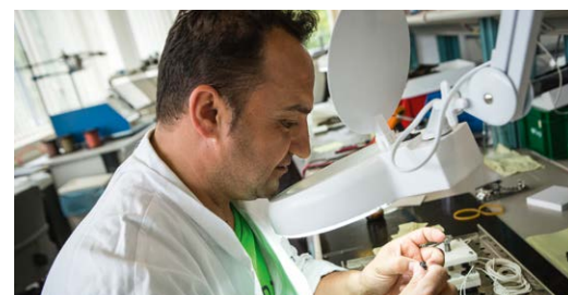
[Production of medical instruments at Fiagon AG Medical Technologies]

sciences sectors diagnostics, medical technology and pharmaceutical/active ingredient development. At present, the major employer in the Innovationsforum is the American diagnostics company Thermo Fisher Scientific B.R.A.H.M.S GmbH with close to 400 employees. Altogether the Innovationsforum Hennigsdorf offers attractive jobs for more than 1,000 people.