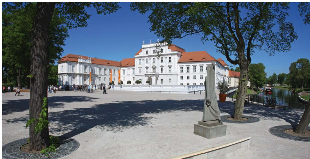
[The baroque castle grounds in the heart of Oranienburg]

The RWK O-H-V as part of the region of Oberhavel is not only an innovative business location, but also an important local recreation area for people living in Berlin and Brandenburg. Tourism gains significance in the region due to the various cultural, scenic and interregional attractions. The extensive floodplains of the Havel, numerous lakes and large forests shape the landscape around the three