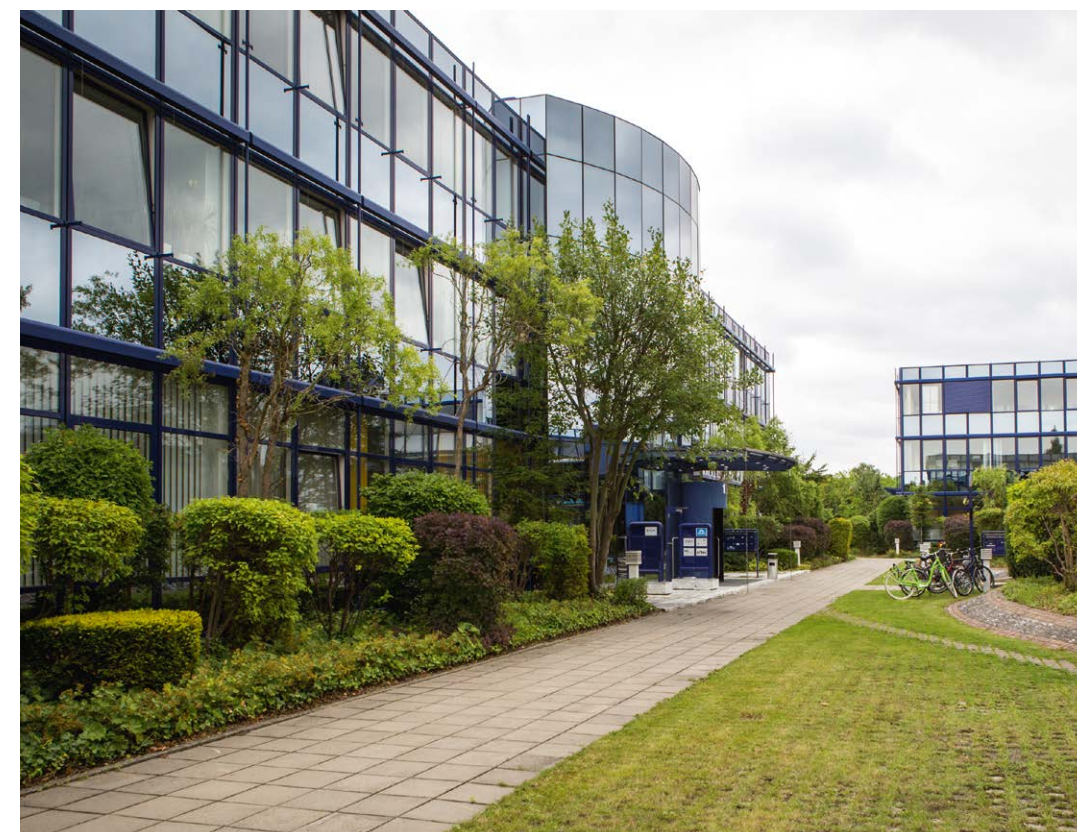
[View from the yard of the Innovationsforum]