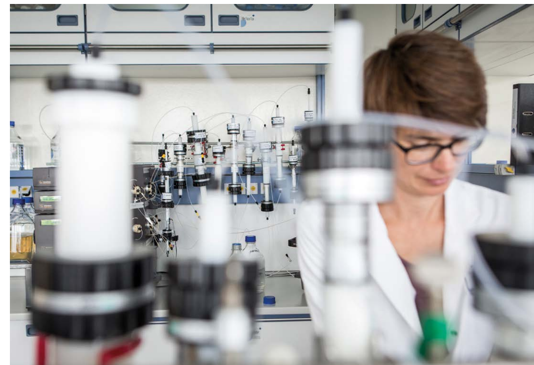
[Modern laboratory spaces at InVivo BioTech Services GmbH]

In 2005, the state of Brandenburg fundamentally realigned its economic development policy with the development of regional growth centres. With this, efficient locations were identified whose industries have particular potential for development. For investments in these selected industries the highest funding rates apply. The RWK O-H-V is involved. Besides the life sciences, further industry focuses determined by the RWK O-H-V are supported such as railway technology, metalworking, plastics- and chemical industry and logistics.