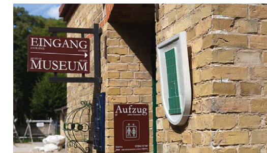
[Industrial history vividly illustrated: the Ofenmuseum in Velten]

Besides the history however, numerous festivals and events attract guests from near and far. The Hennigsdorfer Festmeile (festival), the Veltener Hafenfest (harbour festival), the dragon boat race at the Oranienburg town festival as well as countless concerts, theatre performances and exhibitions are proof of the rich culture on offer in the Oberhavel region.